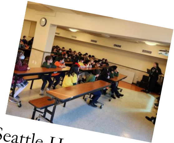
Seattle Humane Visit 11/18/2022