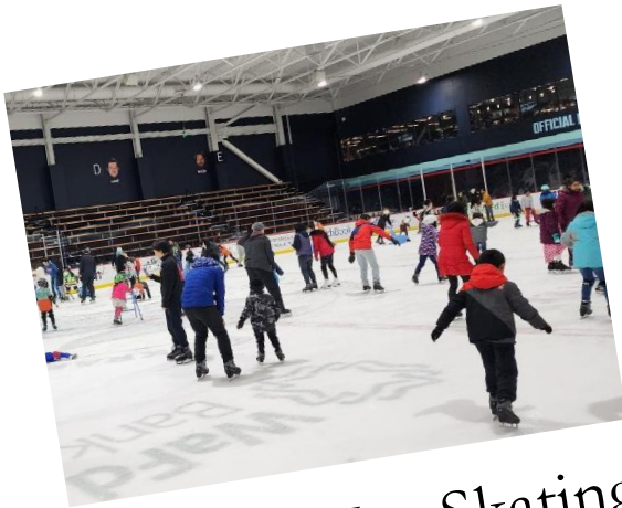
Kraken Ice Skating 12/3/2022