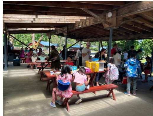
School Picnic 6/3/2023